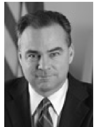
Lt. Gov. Tim Kaine Candidate for Governor

Get involved in the Campaign at www.kaine2005.com