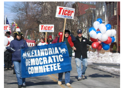
The 2007 George Washington Birthday Parade