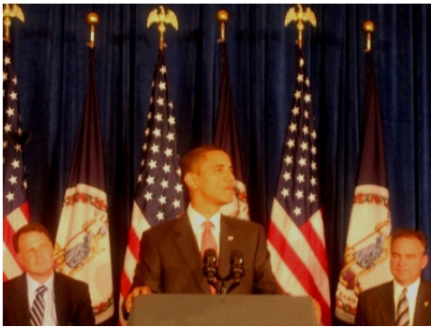
President Obama speaking in support of Senator Creigh Deeds for Governor on left Governor Kaine, right.

I had the once-in-a-lifetime extraordinary honor to represent Alexandria as the kick-off speaker at the Rally for Virginia , August 6 in McLean, held in support of Senator Creigh Deeds in his run for Governor. Featured speakers were President Barack Obama and Governor Tim Kaine. My task was to help warm up the crowd and help participants focus on yet another election in Virginia and how important it is. What I said that evening is even more important now with less than 70 days between now and the election.