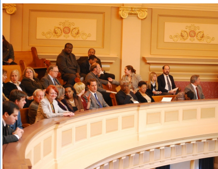
Alexandria's contingent witnesses the voting from the Gallery.